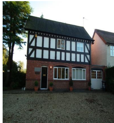
TUDOR HOUSE to the right