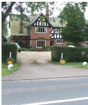
ENTRANCE 913a Uppingham Rd