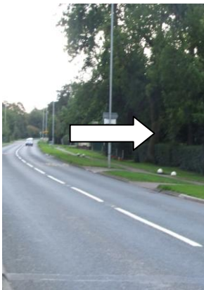
A47 ~ BUSHBY, LE7 9RR